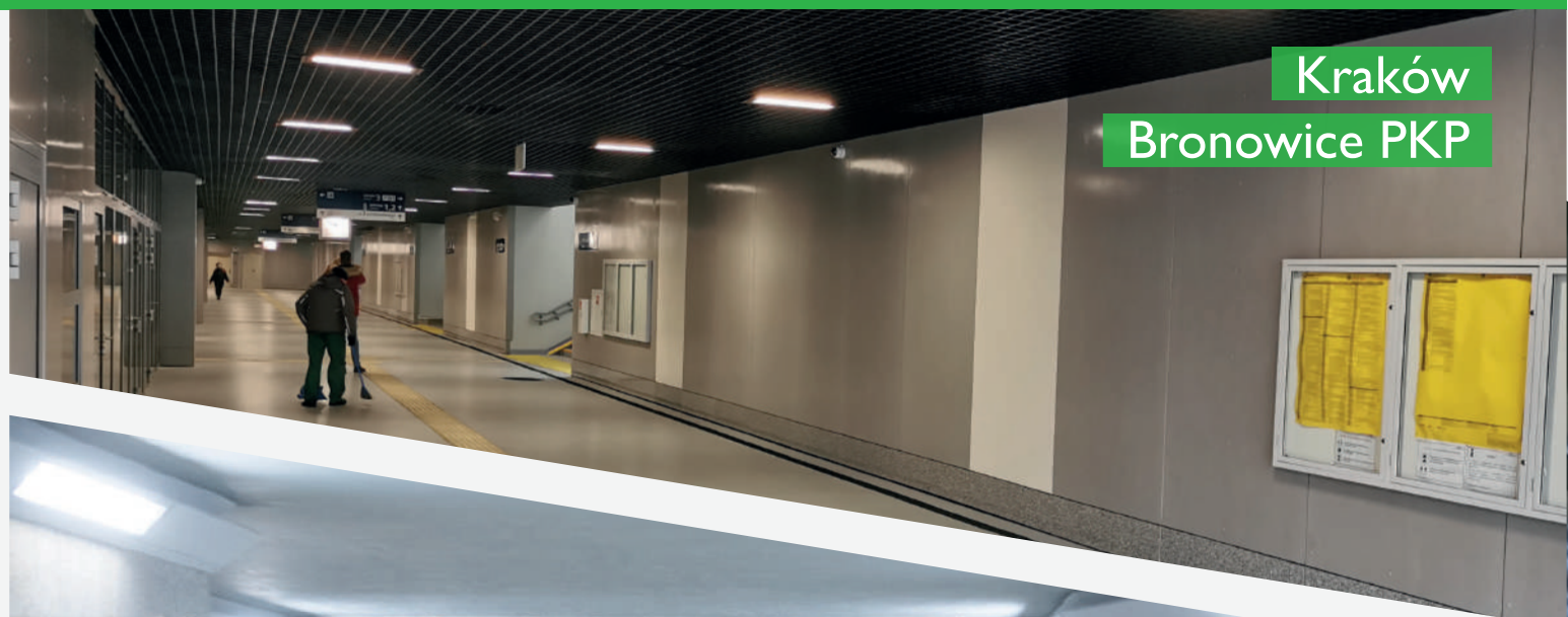
Kraków Bronowice PKP