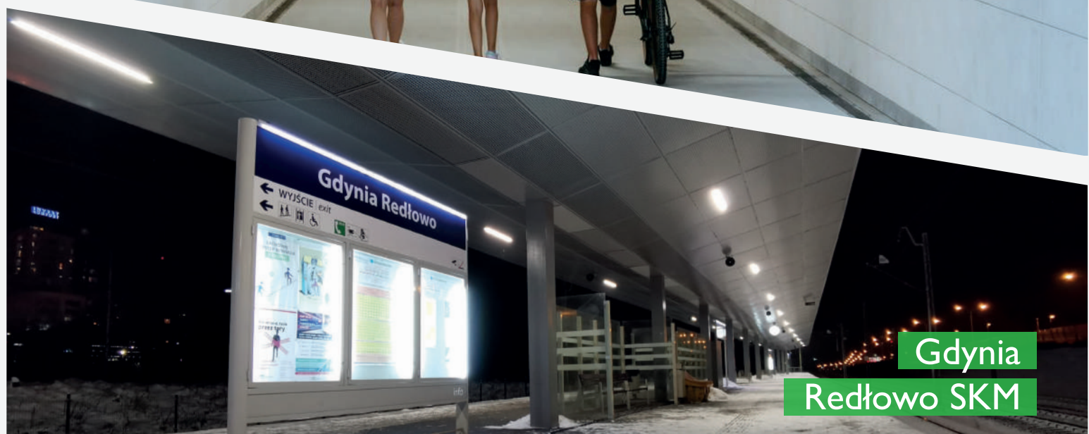
Gdynia Redłowo SKM