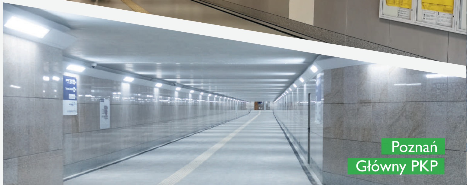
Poznań Główny PKP