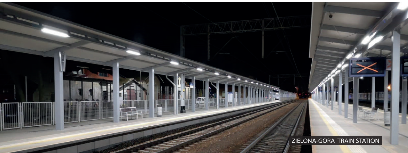
ZIELONA-GÓRA TRAIN STATION

Our installation: Railway station Zielona Gora Poland, the main element of which was the INV320LED - .. RC line system , won the first place in the competition "Best Lighting Investment" organized by the Polish Association of Lighting Producers.