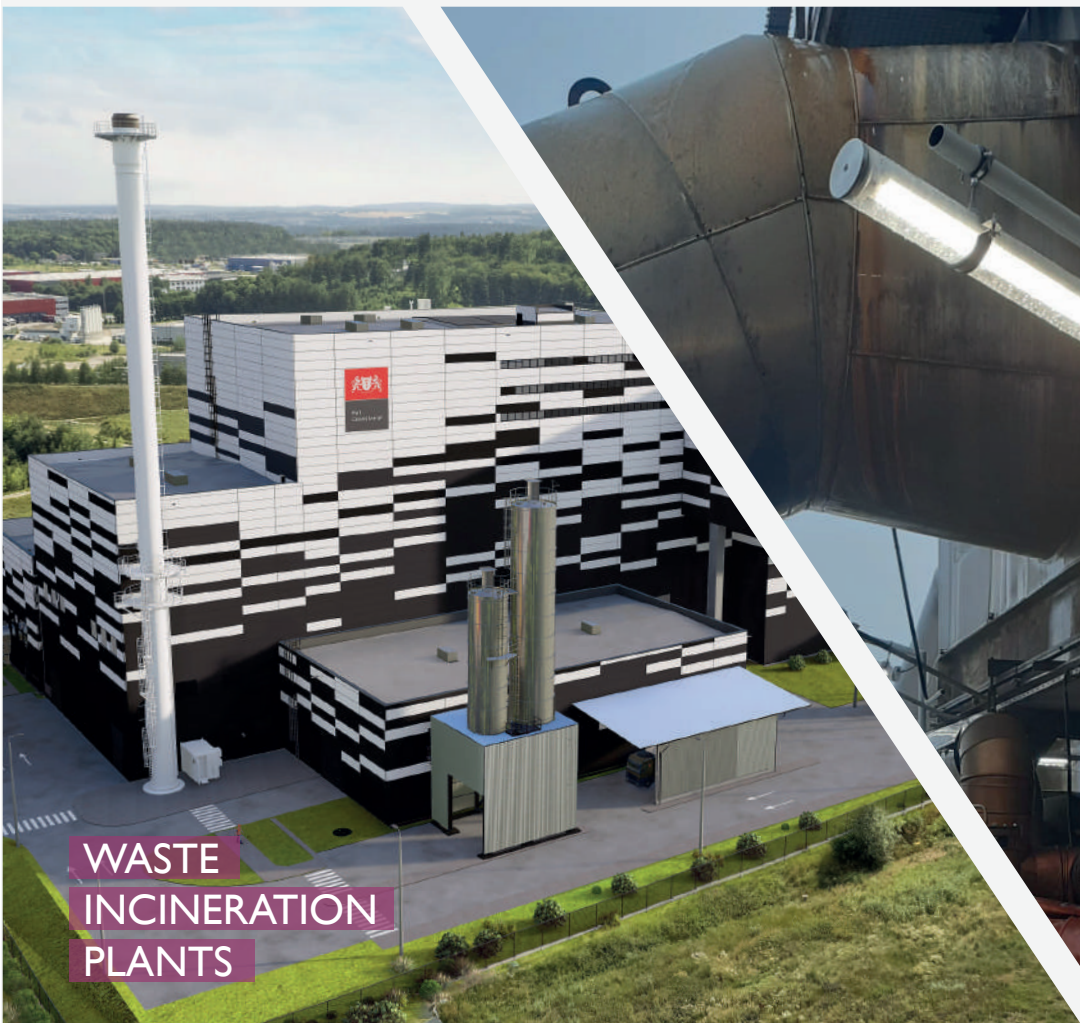
WASTE INCINERATION PLANTS